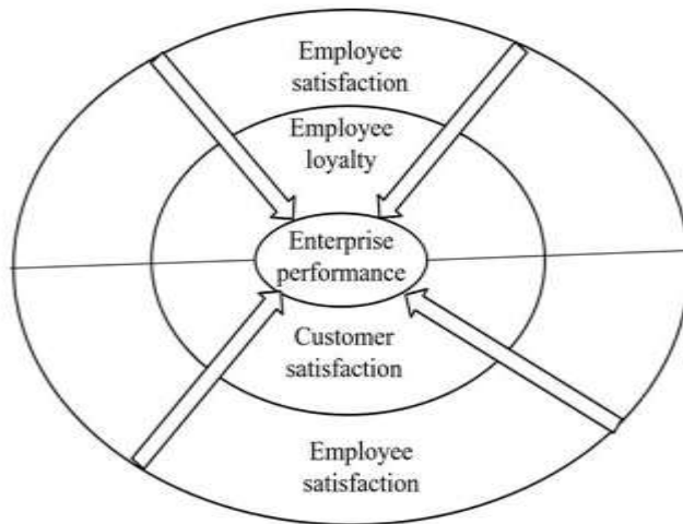
Figure 1: New knowledge

employee loyalty. In doing so, employees become the driving force for implementing customer satisfaction strategies, ultimately maximizing enterprise performance.