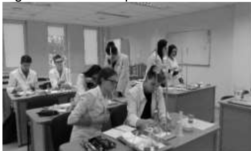
Figure 3. Students prove C vitamin