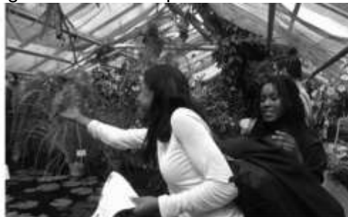
Figure 4. Students look at medicinal plants in the Botanical Garden of Latvia

To obtain information about the benefits, students were asked to write two to five most important ones while studying this course. In total there were 548 benefits mentioned, on average two to four per survey (see Fig.5).