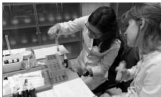
Figure 2. Students prove alkaloids derivatives