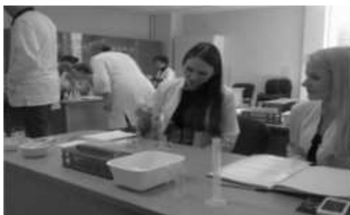
Figure 1. Students prove anthracene