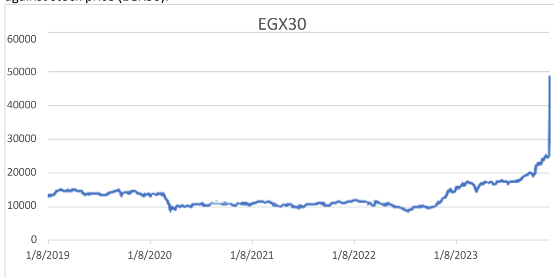
Figure 1: EGX30

The following chart shows the development of the exchange rate of the Egyptian pound against stock price (EGX30):