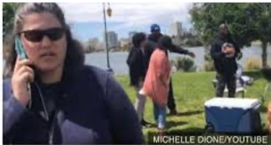
A video of a white woman calling the police about a black family's BBQ has turned into a meme called "BBQ Becky".

Monikers serve to identify individuals by the circumstances that made them unique. Becky, for example, is a pejorative moniker for a woman who is clueless about racial and social issues. In 2019, the dictionary publisher Merriam Webster wrote that Becky was increasingly functioning as an epithet, and being used to refer to a White woman who is ignorant of both her privilege and her prejudice. Figure 1 is an example of a BBQ Becky-themed meme.