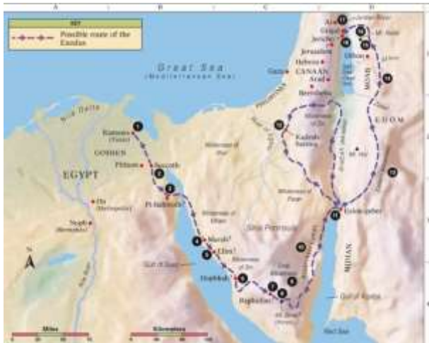
Figure 1. Israel's Exodus from Egypt and Entry into Canaan (Israel), after Gilbert, 1997. The Israelites' course is marked by the dashed line with arrows. The numbered points along the route indicate the stations where the Israelites camped for extended periods.